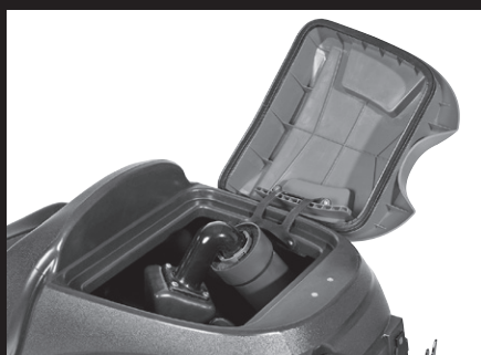
Large opening to the 19.2 gal (73 L) recovery tank allows easy cleaning.